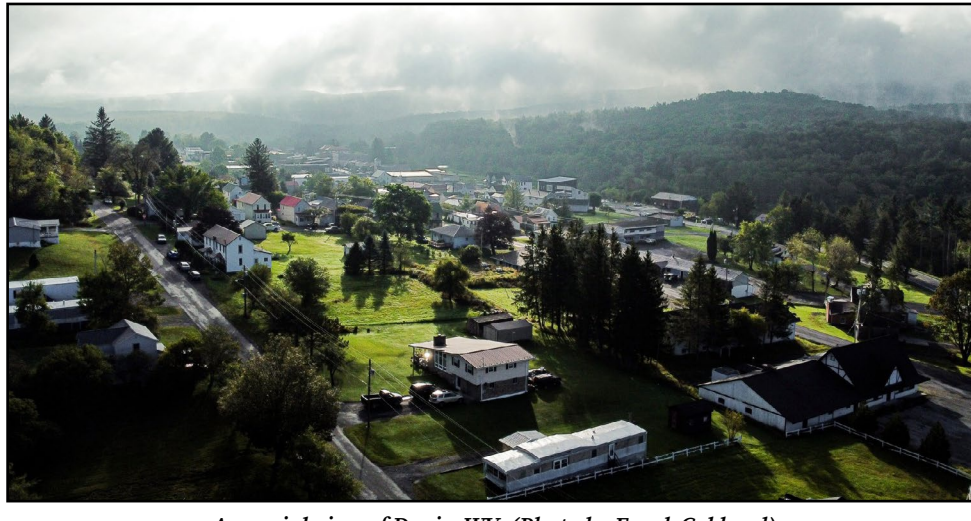
An aerial view of Davis, WV.

In a letter addressed to U.S. Department of Transportation Secretary Pete Buttigieg, the business owners expressed their deep concerns about the currently recommended southern alignment (ROPA) for the 10-mile stretch of Corridor H between Parsons